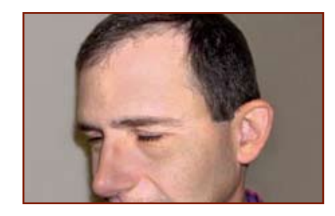
Post-Operative: 1 year

Titanium plate was removed and cranium was augmented with the Mimix material.